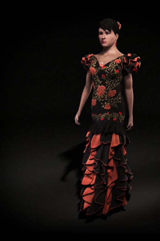
FEMALE 05 POSE 2