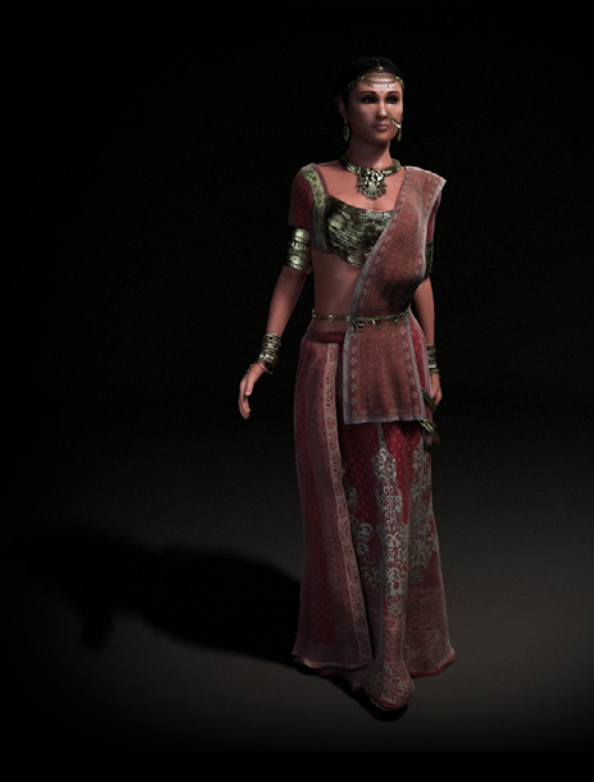
FEMALE 04 POSE 4