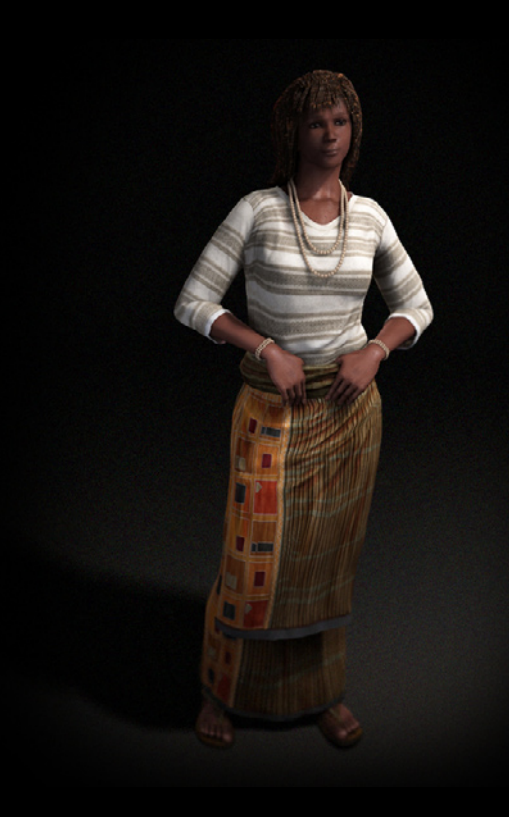
FEMALE 02 POSE 2