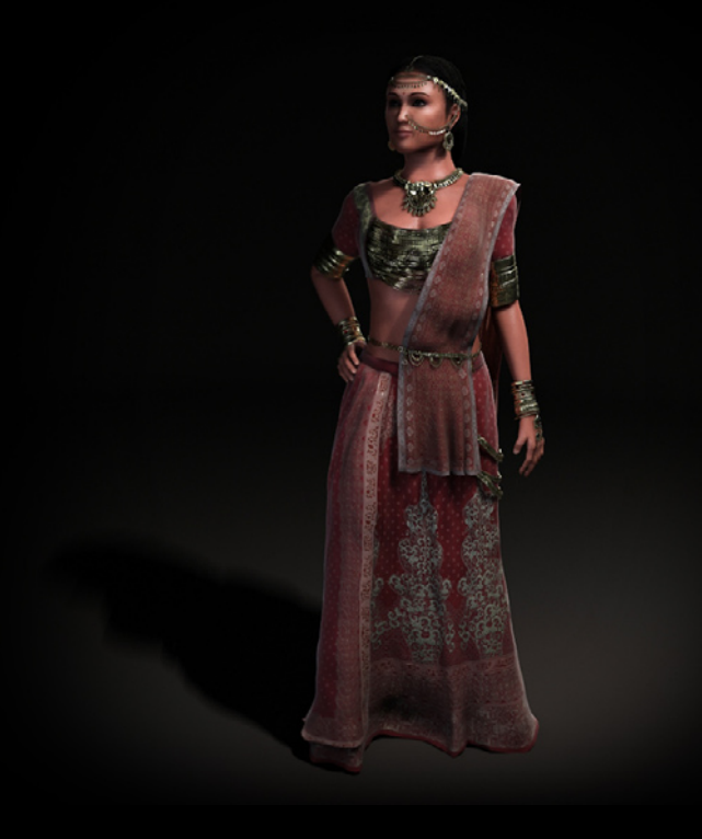
FEMALE 04 POSE 2