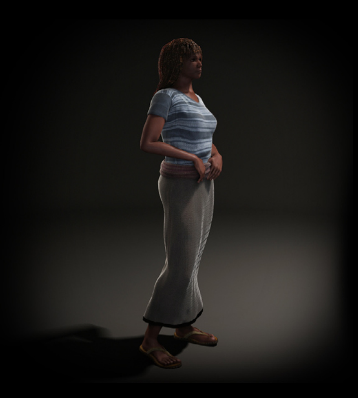
FEMALE 02 POSE 2 V2