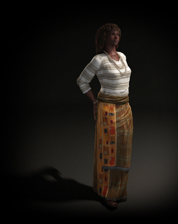
FEMALE 02 POSE 4