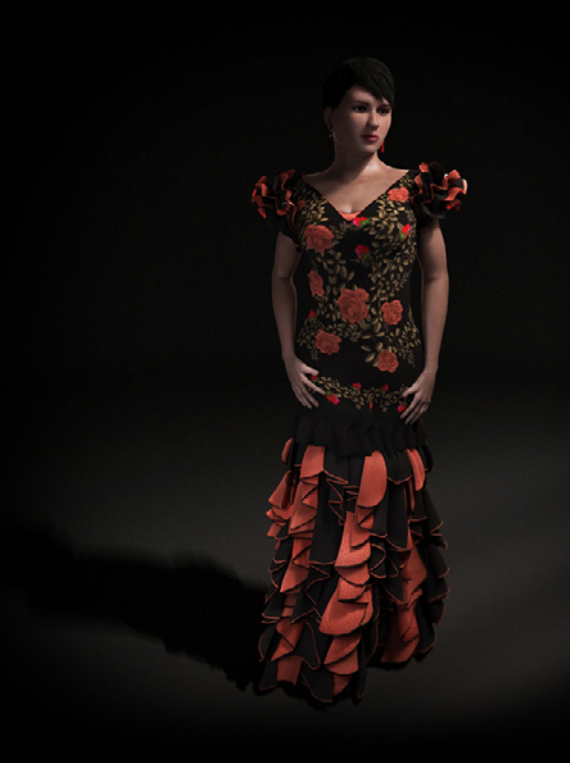
FEMALE 05 POSE 4