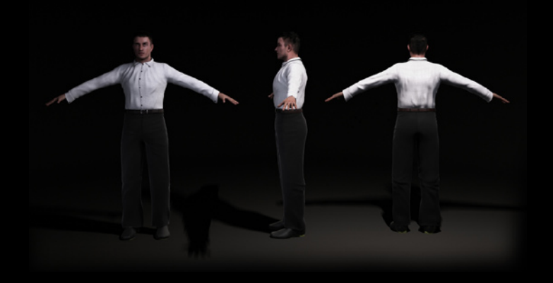
MALE 05 T-POSE V2