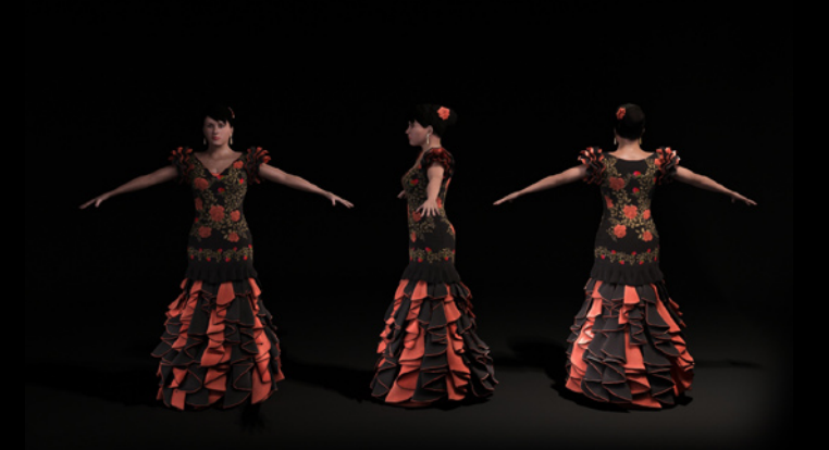
FEMALE 05 T-POSE