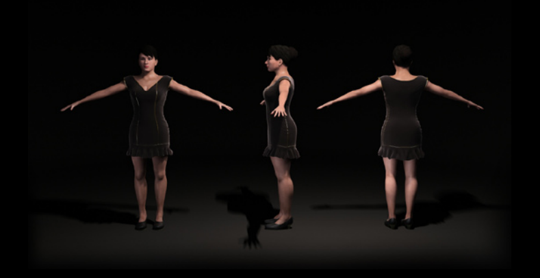
FEMALE 05 T-POSE V2