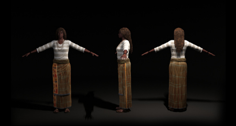
FEMALE 02 T-POSE